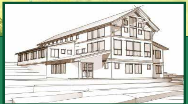
CONCEPTUAL DESIGN BUILDING TWO